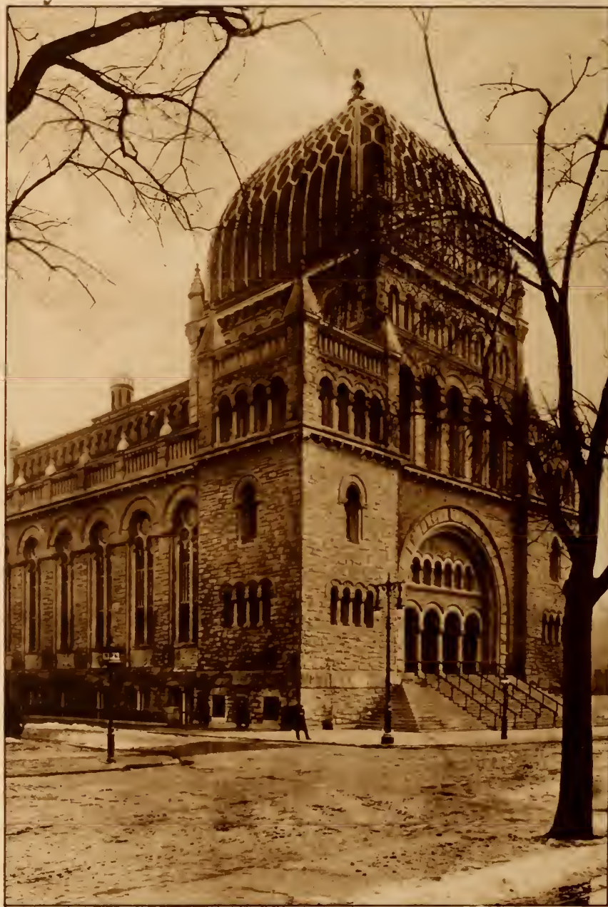
TEMPLE BETH-EL. Jewish synagogue, situated on 5th Avenue at 76th Street. Its gilt-ribbed dome gives the edifice a distinct note of individuality.